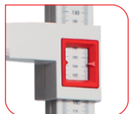
Two large windows and double-sided scale for easy readout.