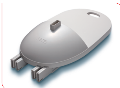
Integrated handle and secure catches on all individual parts for transport ease.